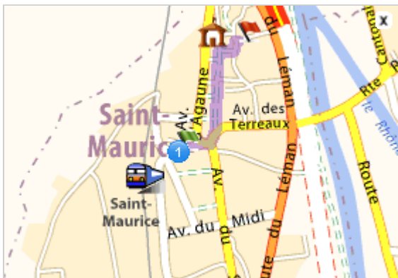
Salida: Saint-Maurice — Avenue de la Gare